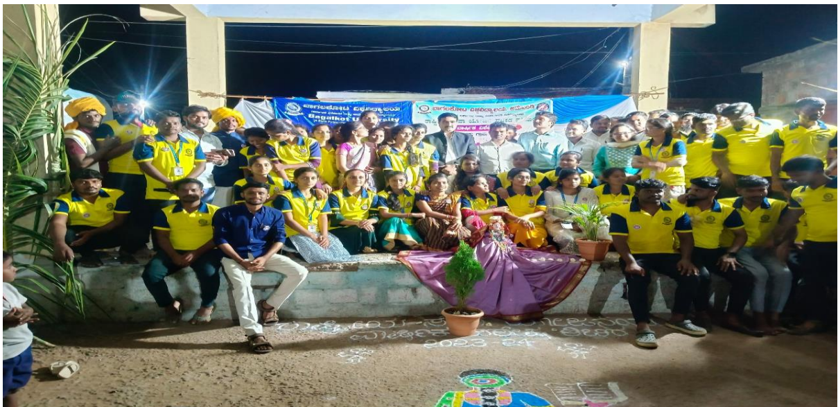
Annual Special Camp 2023-24