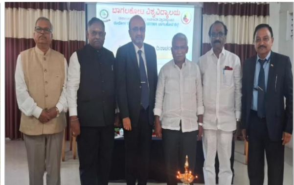
Celebrated 2 nd Foundation Day