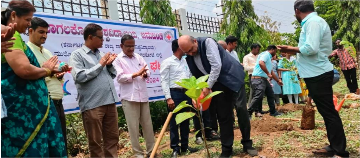
Celebrating World Environment Day