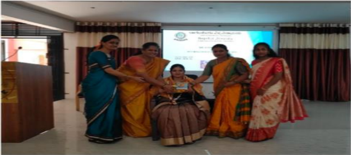
International Women's Day