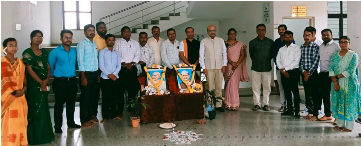
Celebrated Mahatma Gandhi and La Bahadur Shah Jayanti