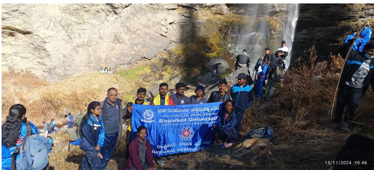
Students participation in Adventure Camp Organised by Atal Bihari Vajpayee Institute of Mountaineering and Allied Sports Manali, Himachal Pradesh