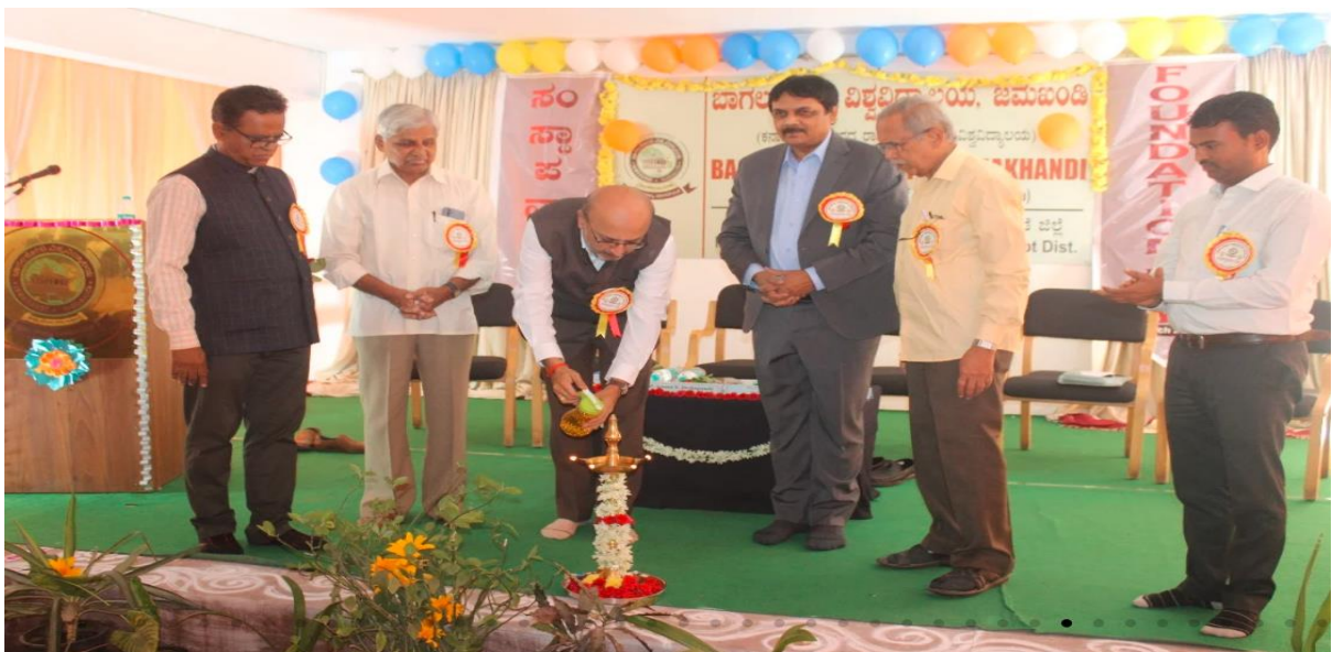
Celebrated First Foundation Day of Bagalkot University