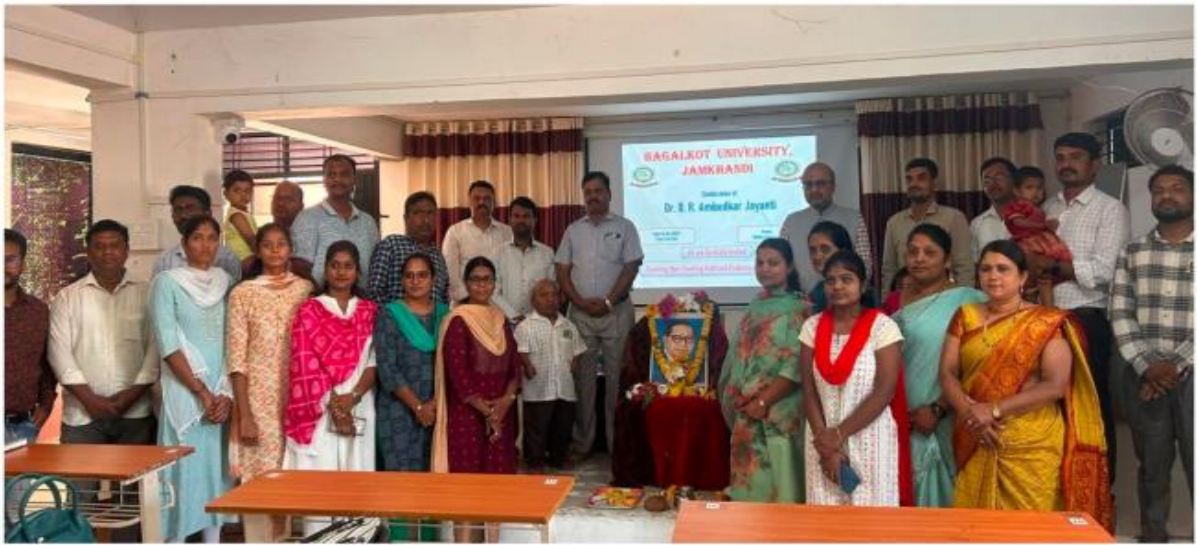
Dr. B. R. Ambeskar's Jayanti