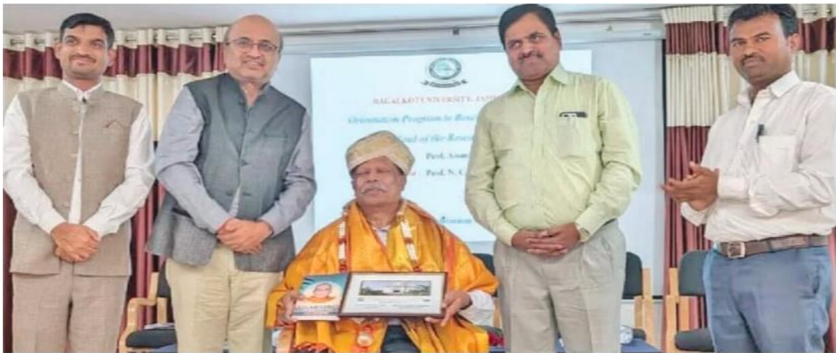
Orientation Program to Research Supervisors and Head of the Research Centres