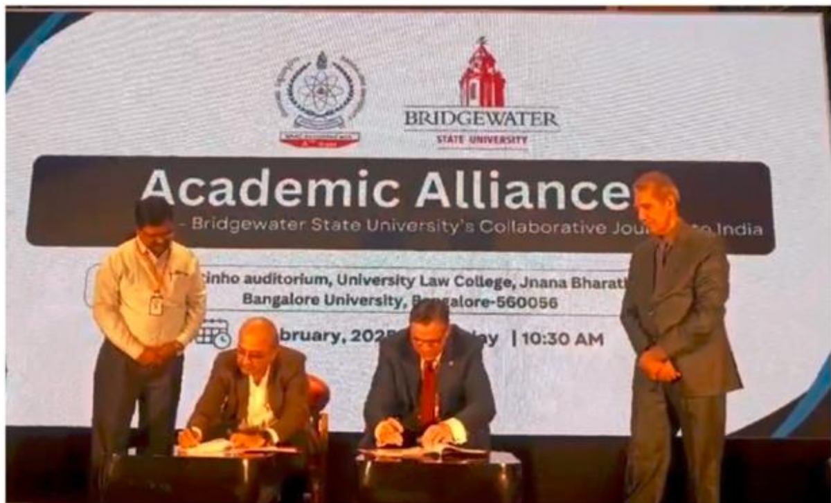
MoU with Bridge Water State University, MA USA