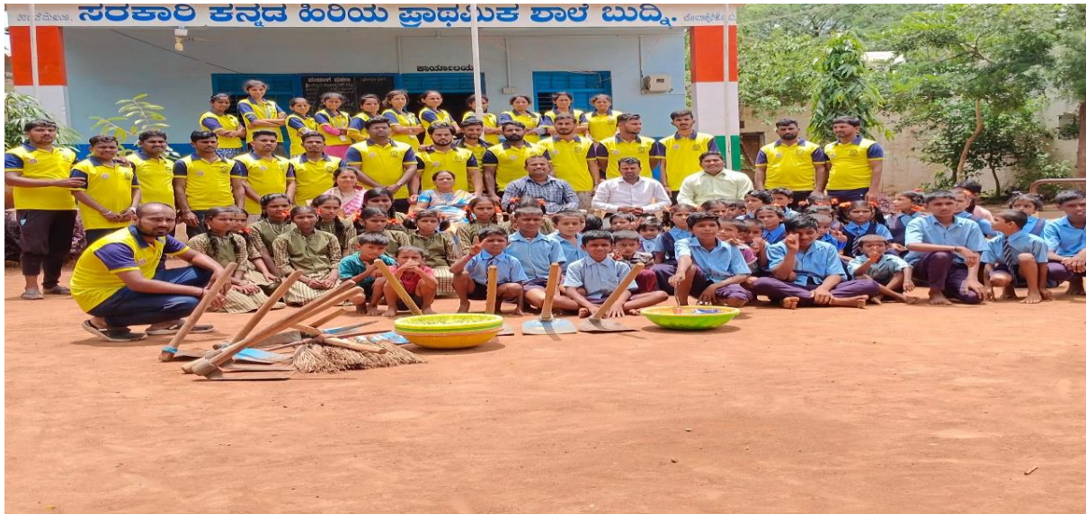
Annual Special Camp 2023-24