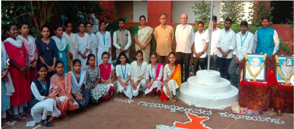
Celebrated 75 th Republic Day